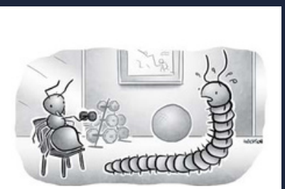
"Man I hate leg day."